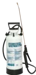
Spray-Matic 5 P