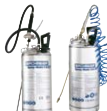
Spray-Matic 5 S / 10 S