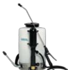
Spray-Matic 10 B